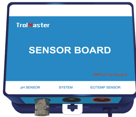
AMP-2 For Aqua-X Irrigation Control System